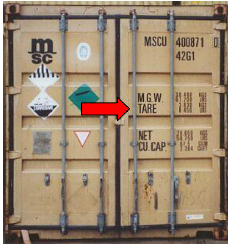
BOOKING AGENT VERIFIED WEIGHT MASS (WEIGHT) FORM: